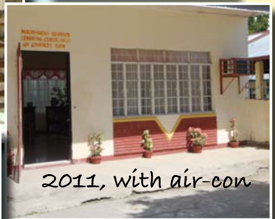
2011, with air-con