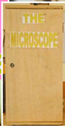
Sports goods, books and fans for the High School