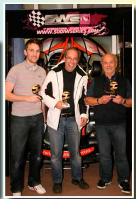
We couldn't do this without your support - thank you!