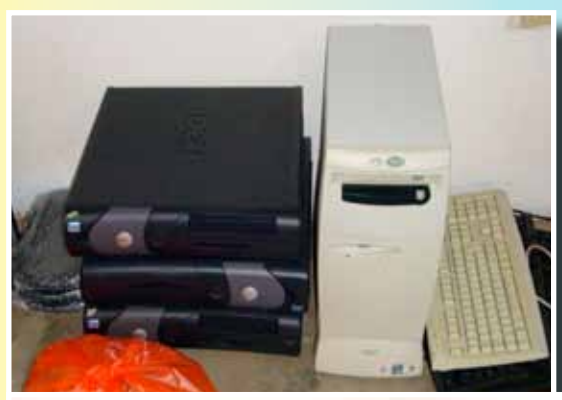
All the usual fun of unpacking the boxes