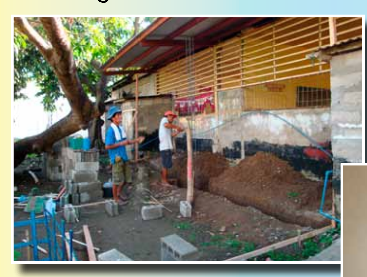
and the old wall demolished as the new one is built