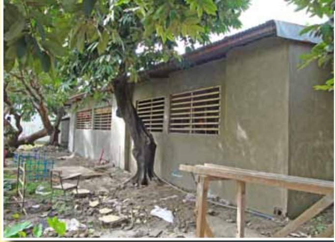
"after", from the rear