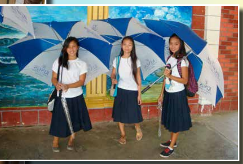
umbrellas are popular too!