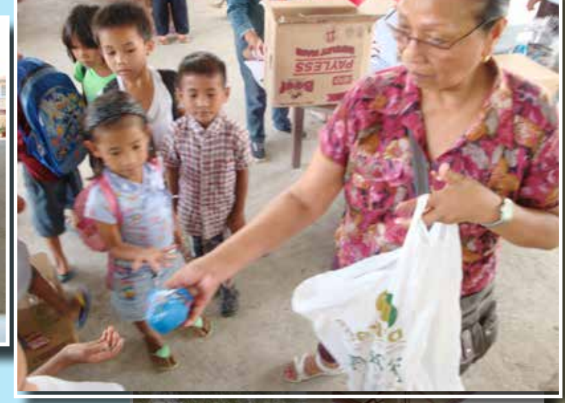
They queued patiently in line