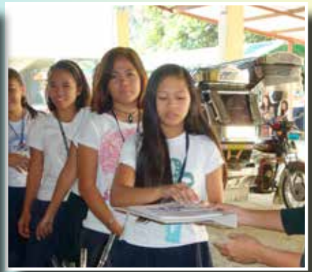
standing in line, waiting to receive their gifts