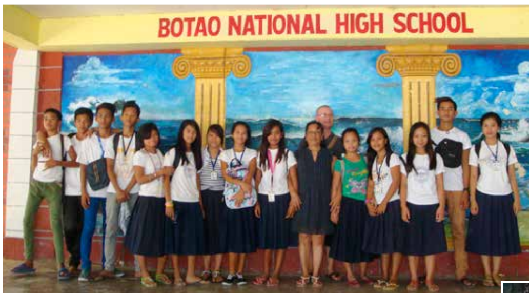
A group of happy students, we're going to pay their school fees for the 2015-2016 school year