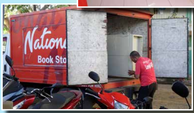
steel cabinets for the high school

Printers for the high school and fans for the new classroom