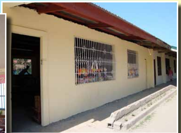
and the outside of the canteen building too!