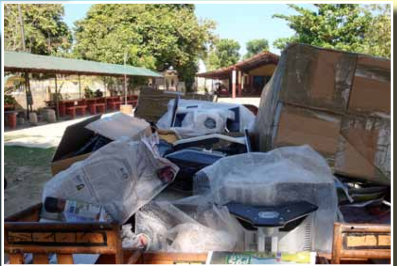
Loaded up and taken to the school