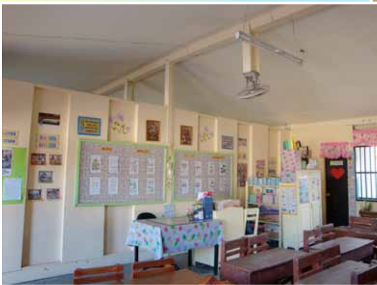
We gave a couple of the classrooms a lick of paint