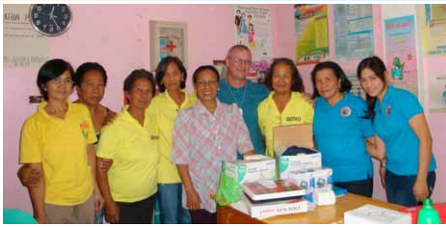
The barangay health workers pose with the nebulisers, B.P. monitors and scales we supplied