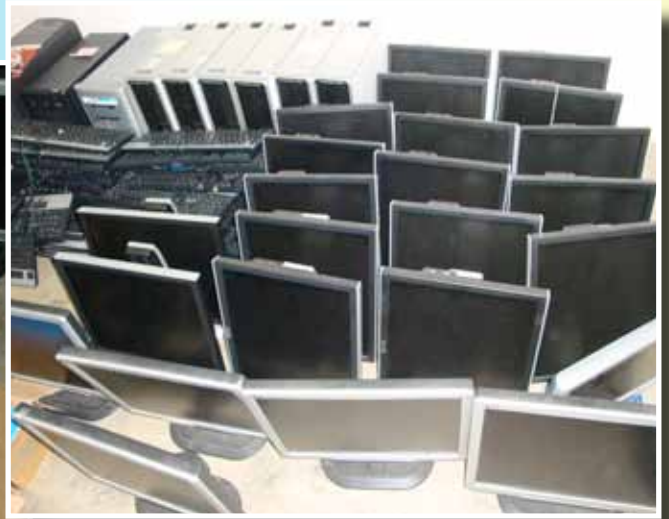
Computers and monitors