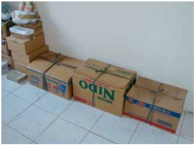
Boxes of books, sorted for High school and Elementary school