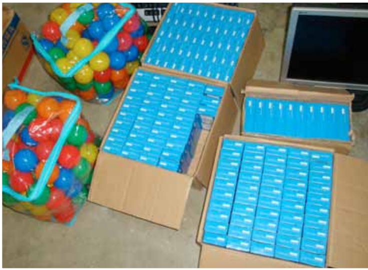
Boxes of calculators