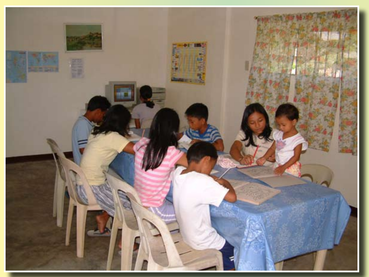
and added some kids! The effect was instantaneous, riotous and captivating.

We decided to build two more similar rooms, one each in the Elementary and high schools