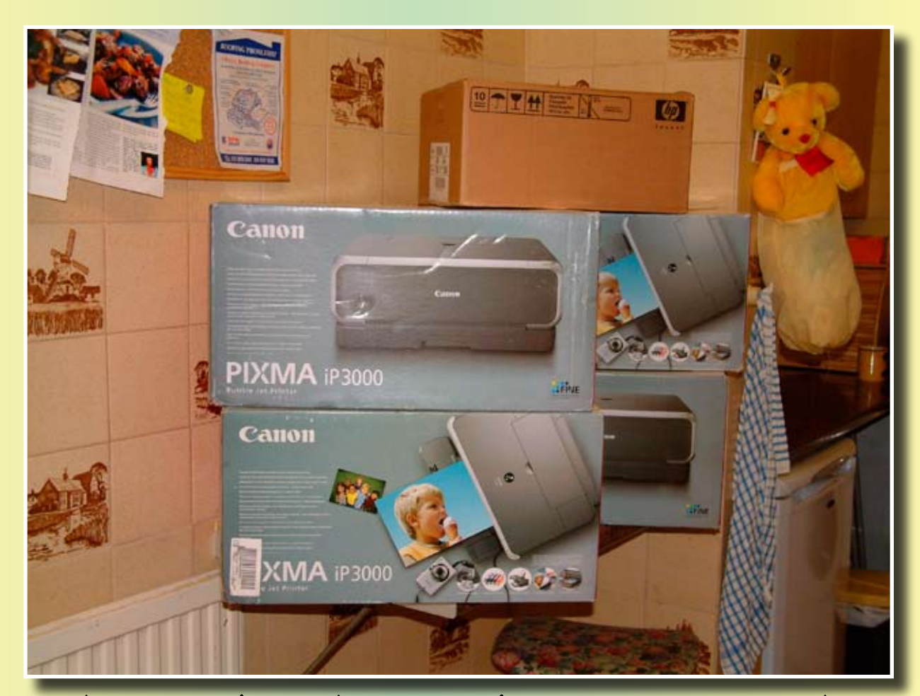
A friend gave 4 brand new ink jet printers and a whole box full of ink jet cartridges!