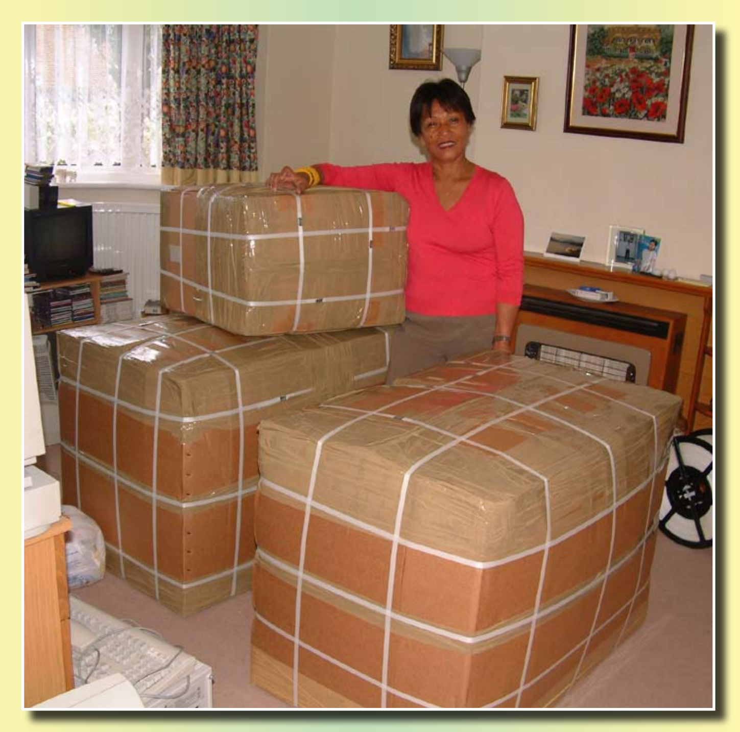
Despatched 16th August 2006

We pay for the freight as always to ensure that all of the donations go directly toward helping the kids.